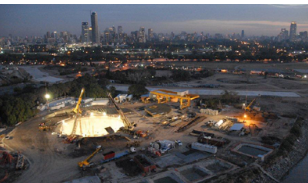
Ghella's Maldonado construction site Buenos Aires (Argentina).

The impact of the floods in Queensland was keenly felt in Italy, also given the large Italo-Australian community that resides in the State. President Giorgio Napolitano sent a letter to Governor-General Quentin Bryce expressing his sorrow at the loss of life and looking forward to a return to normality for the families and businesses affected.