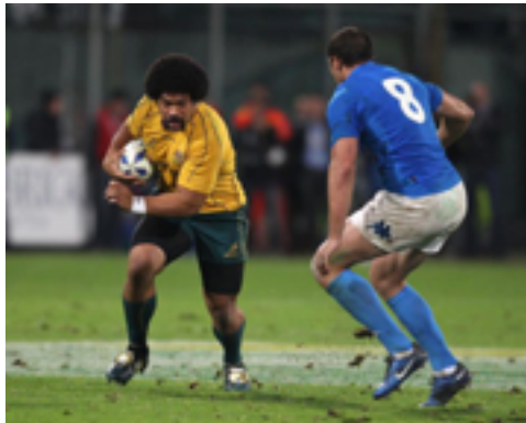
The Wallabies vs the Azzurri in Florence.