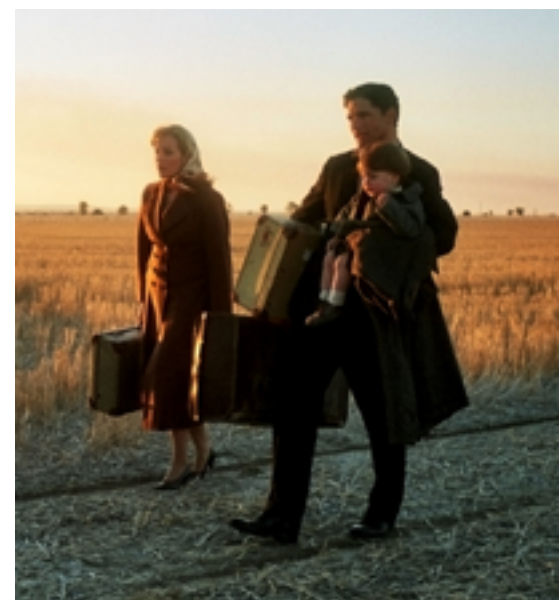
Scene from Romulus, My Father.

Featuring Eric Bana and the young Kodi Smit-McPhee , this is one film not to be missed at the festival.