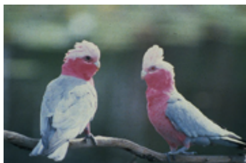
A galah is a common bird in Australia, and is also a slang term for a 'silly person' (see 'Say Again' below). Image from anra.gov.au .

Article and image from Science in Public .