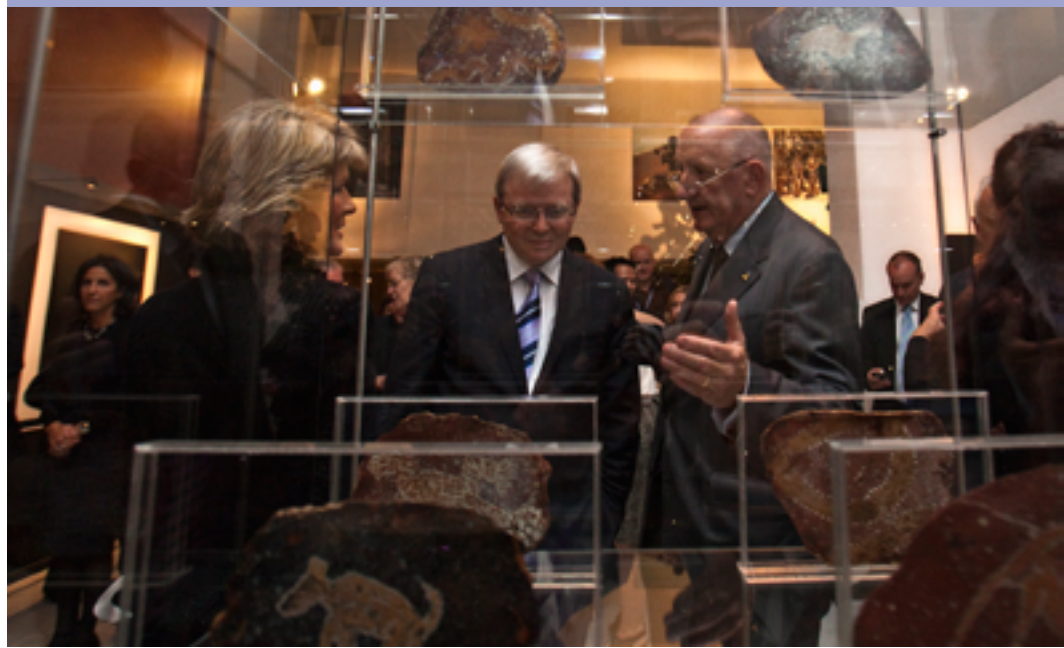
L-R: Shadow Foreign Minister the Hon Julie Bishop MP, Foreign Minister the Hon Kevin Rudd MP and Australian Ambassador to the Holy See the Hon Tim Fischer at the inauguration of the "Rituals of Life" exhibition.

The "Rituals of Life" exhibition was also supported by the Australian Embassy to the Holy See, Qantas Airways and Tourism Australia .